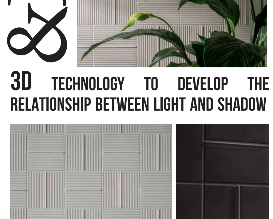
MONOCHROME AND OLD-FASHIONED SHAPES REINTERPRETED BY AN OLD TECHNIQUE: